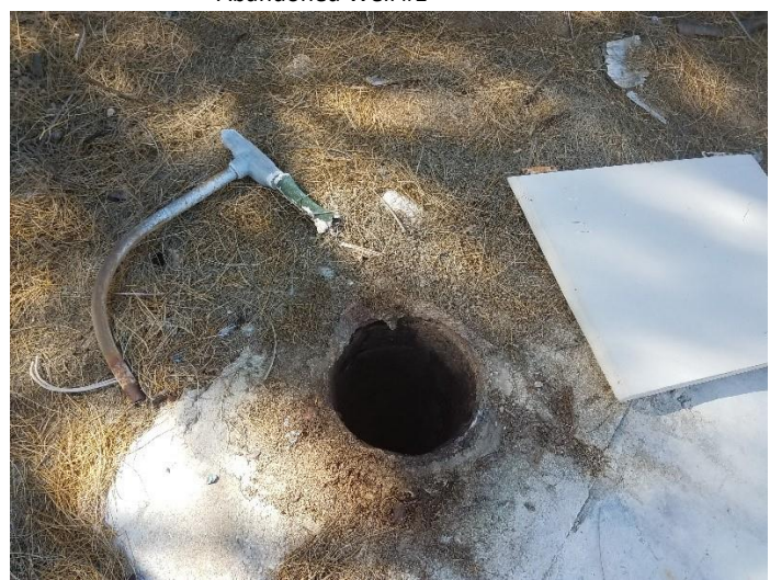
Abandoned Well #2