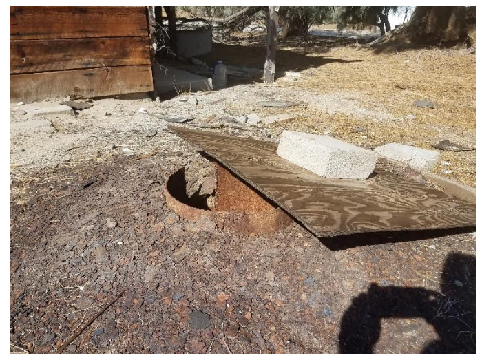
Abandoned Well #1