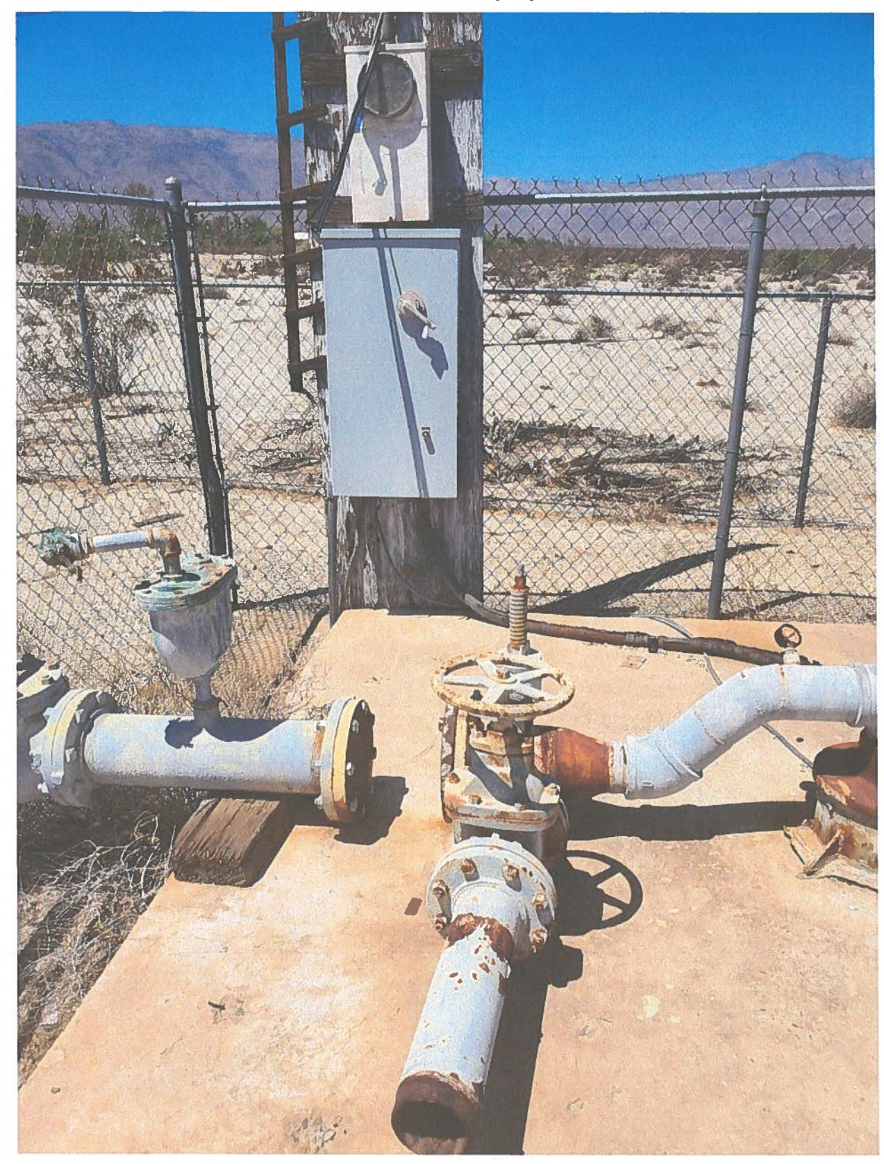
Paddock Well 5-5-2022